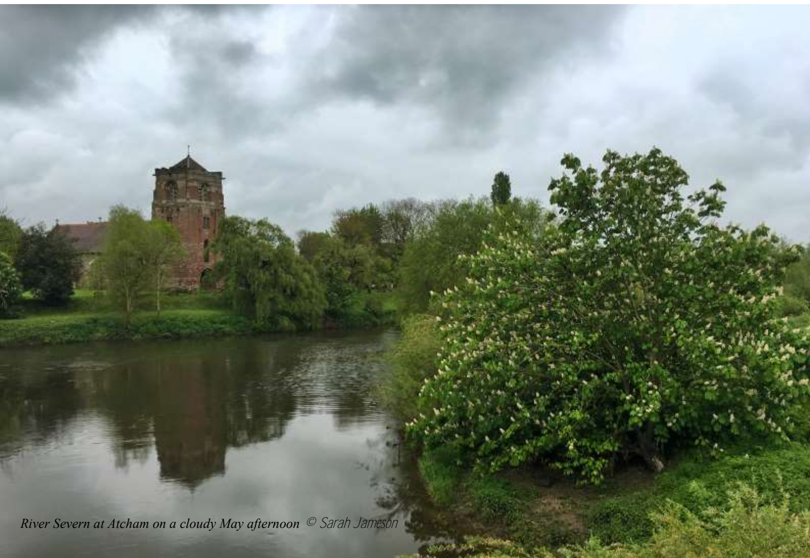
River Severn at Atcham on a cloudy May afternoon