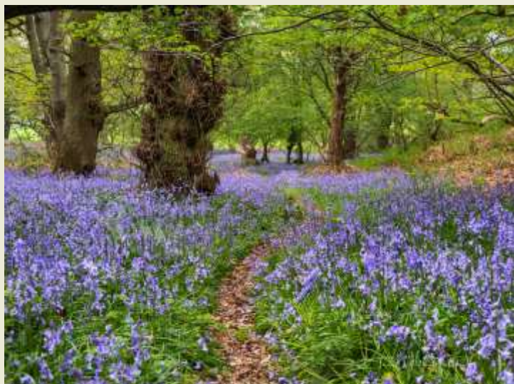
Bluebell Woodland Walk, The Wrekin