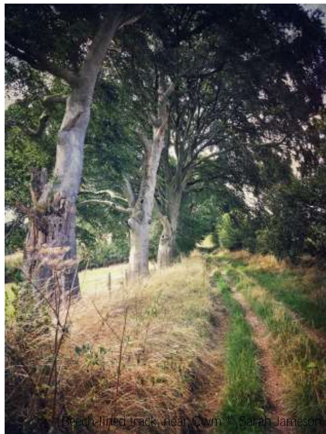
Beech-lined track, near Cwm