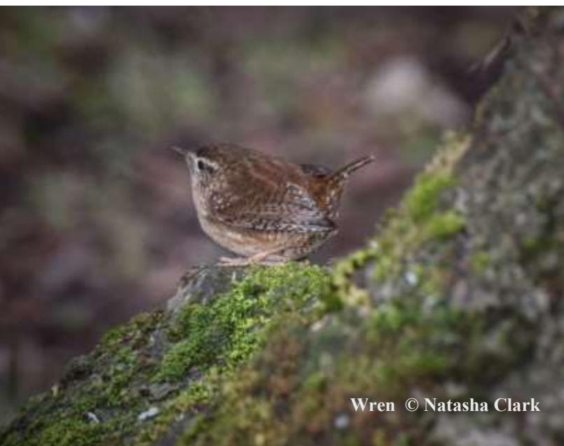
Wren © Natasha Clark