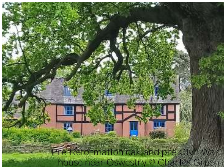
Pre-Reformation oak and pre-Civil War house near Oswestry