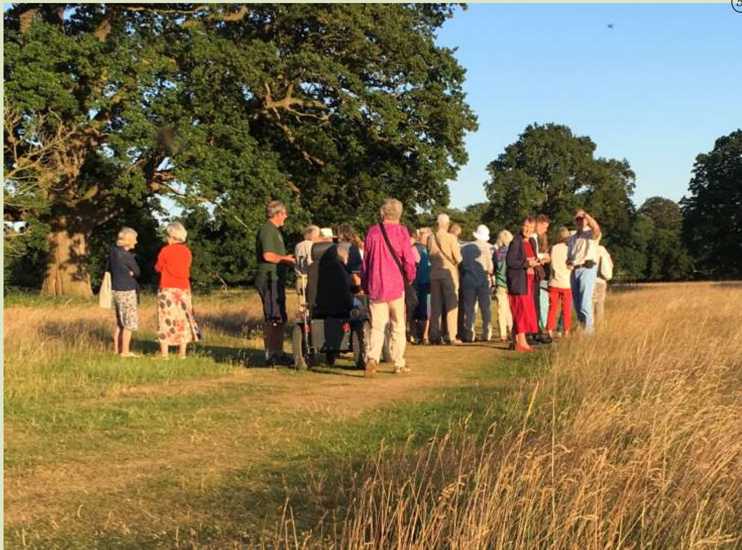
Our sun-soaked AGM guided walk in the grounds of Attingham Park last July