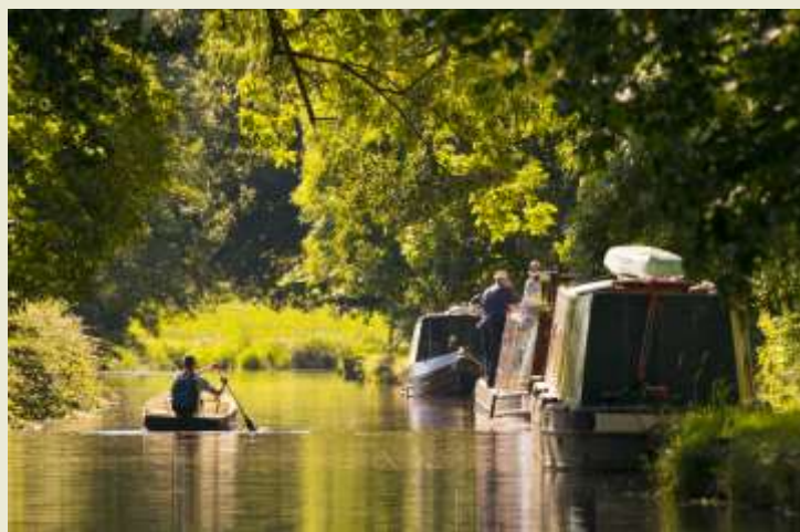
A peaceful scene on the Llangollen Canal at Ellesmere