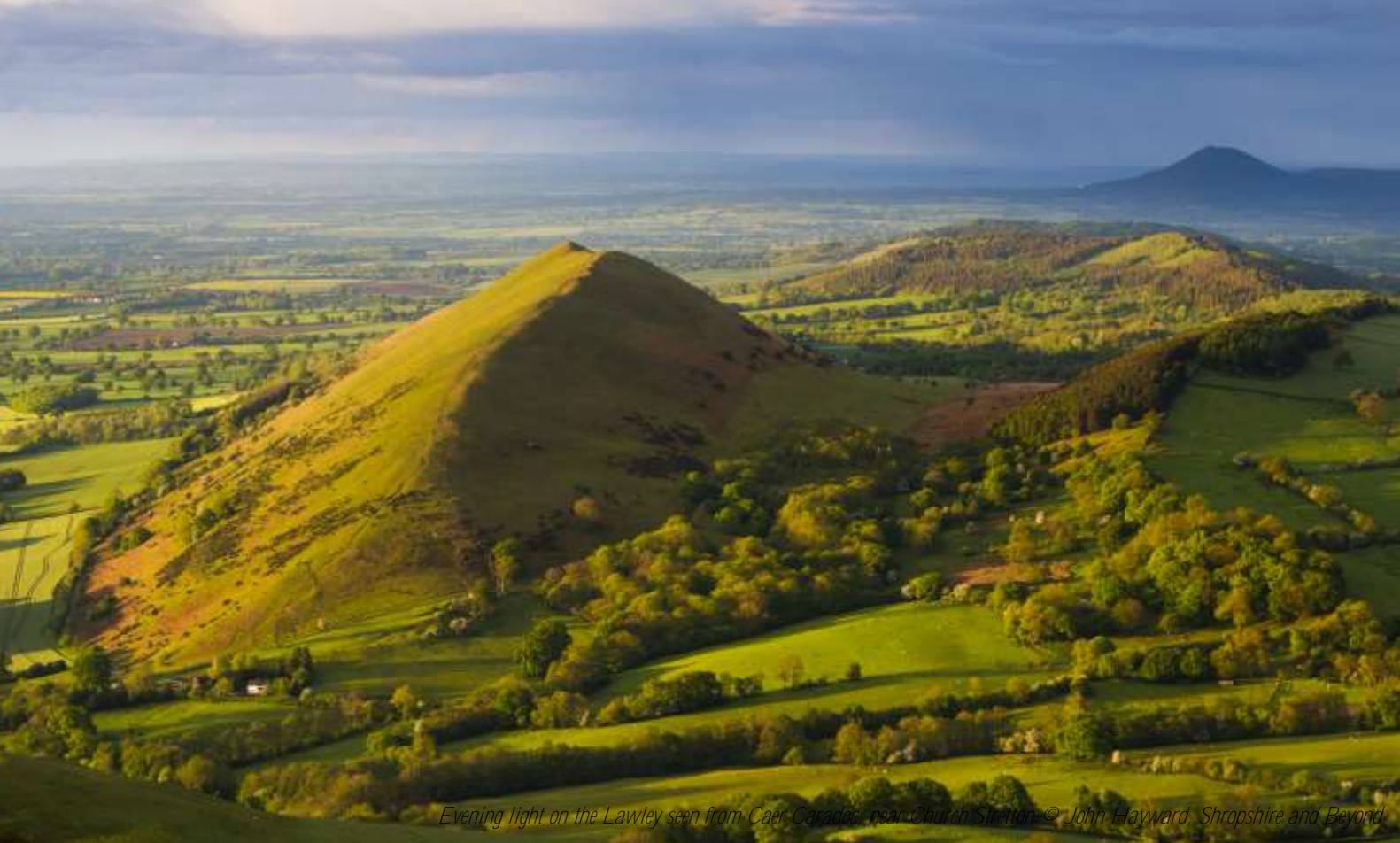
Evening light on the Lawley seen from Caer Caradoc, near Church Stretton